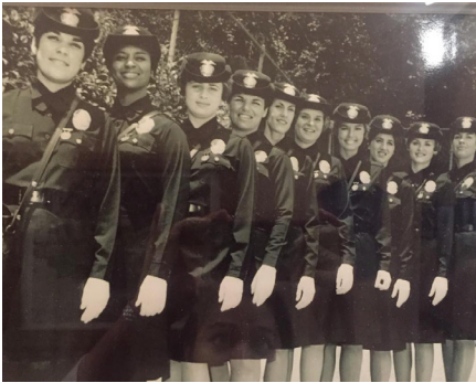
LAPD 1967 The Mighty Ten